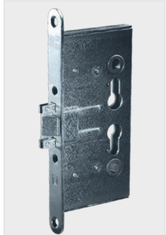
Art. 1739 Standards: CE marking, EN 12209 and EN 179 (Panic)